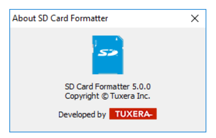
Figure 2: Version information

On Mac OS X/macOS operating systems, click the [SD Card Formatter] menu and then click [About SD Card Formatter].